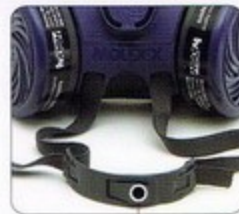
Contoured neck buckles for comfort and quick attachment