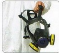
Lightest weight facepiece of any popular model. Weighs less than 12.7 oz.