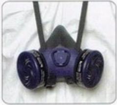
7000 in Drop Down Mode