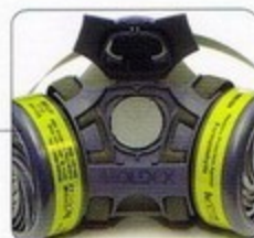
Attached exhale cover for easy inspection