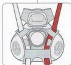
Lock down mode