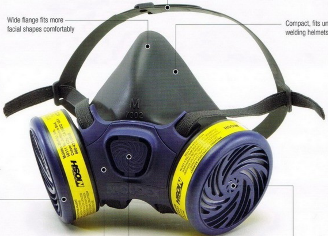
Compact, fits under welding helmets