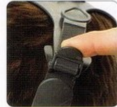
Over-molded buckles for secure strap attachment. One finger strap release