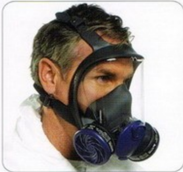
Easy to wear