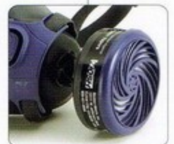
Easy mount bayonet cartridge/filter attachment