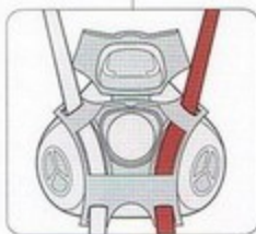
Drop down mode